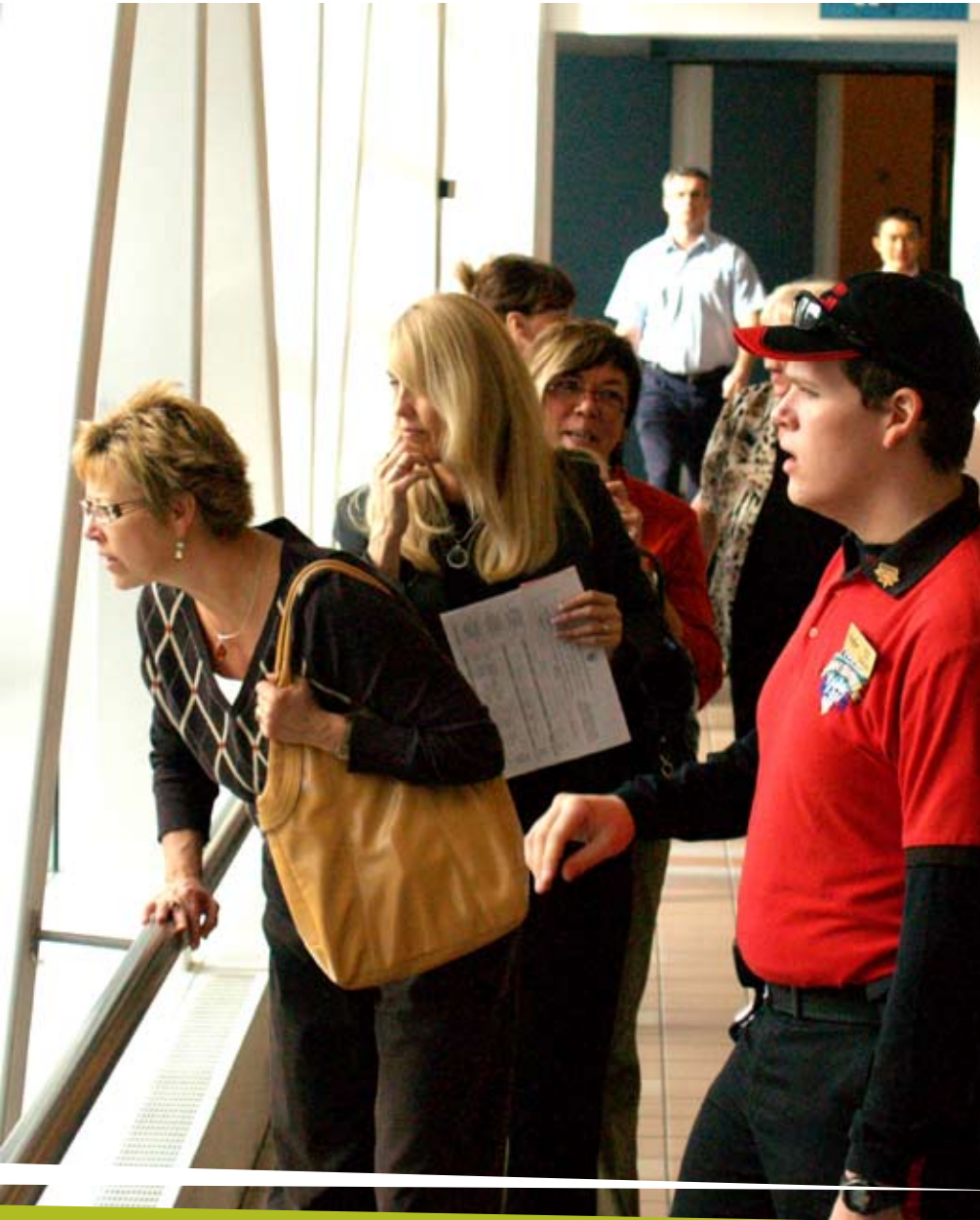
ABOVE: Employees check out the new Hydro building while on a BIZ tour.