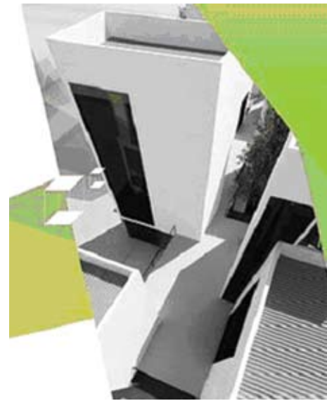
One of the 18 2-4 storey YouCube townhouses, for both residential and commercial uses, starting at $195,000

Check our website in the new year, at www.downtownwinnipegbiz.com for scheduling and features. ■