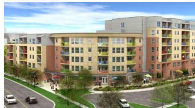
High class, loft-inspired condos on Waterfront Drive, from 800sq. ft. to almost 2,000 sq. ft.