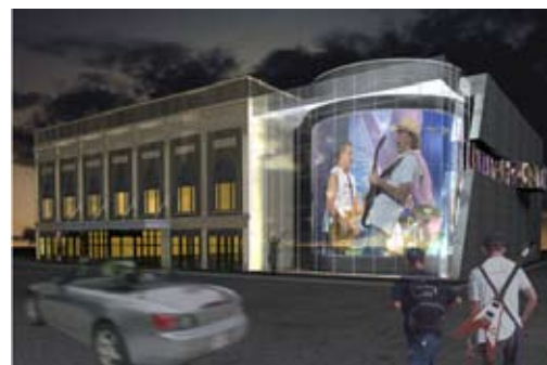
The proposed Metropolitan design with the Rock'n'Roll Centre

The neo-classical style Met is the only theatre of its kind remaining in Winnipeg in its original form, with potential seating for 2,500 concert goers. ■