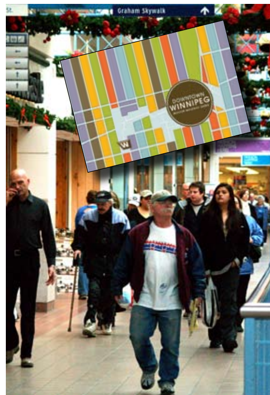
Navigating the walkway will be a snap thanks to the new Walkway Brochure (inset).

Watch for the new walkway guides in the new year. ■